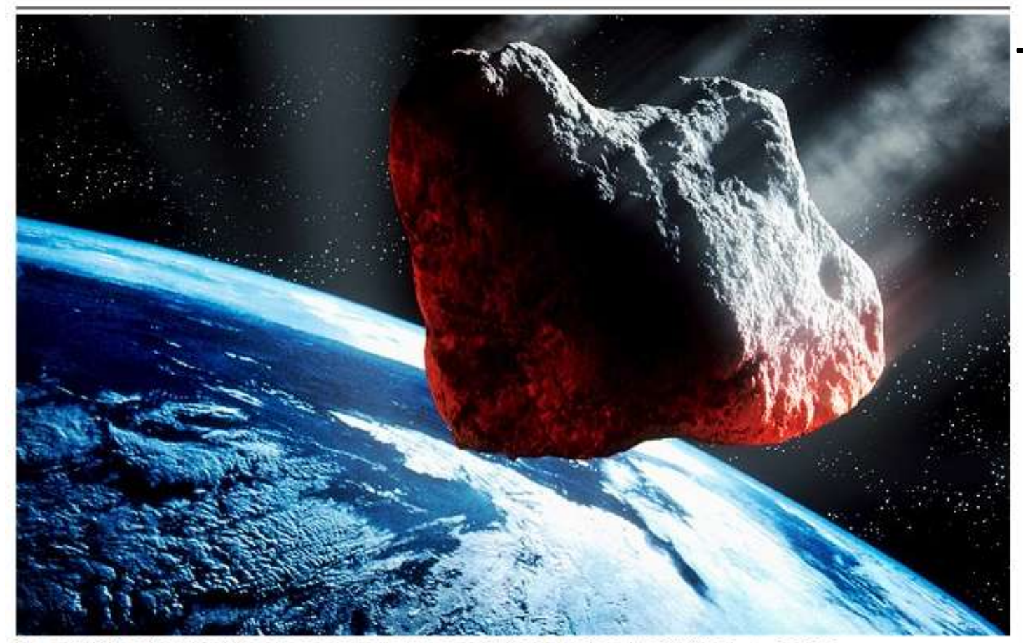
The asteroid's path makes it the closest space-rock to pass by the Earth since June 2011

An asteroid will today make one of the closest cosmic near-misses with Earth ever recorded.