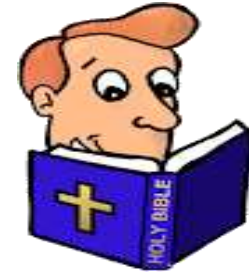
Read the Word