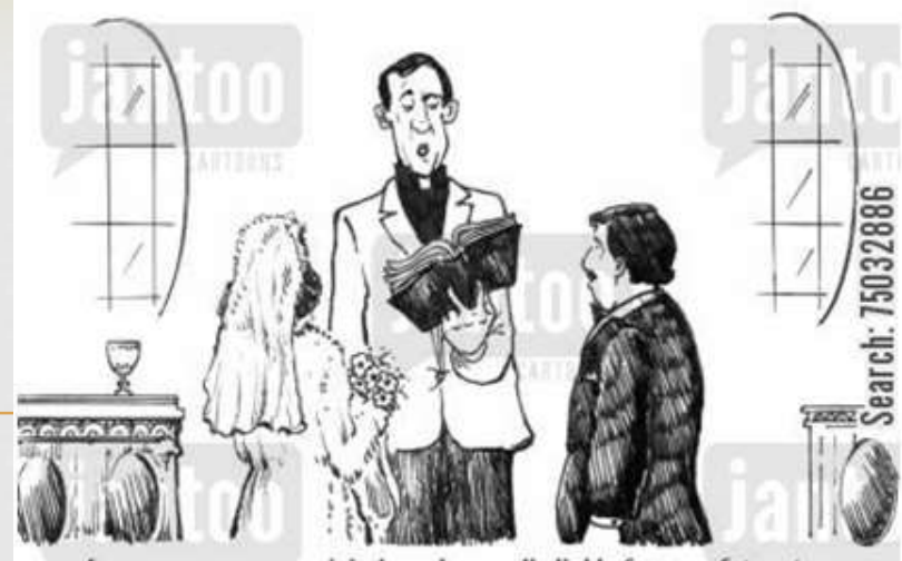
I now pronounce you jointly and severally liable for your future tax returns.