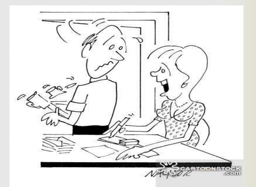
"Gosh, I've never used up a whole chequebook in a single day before!"