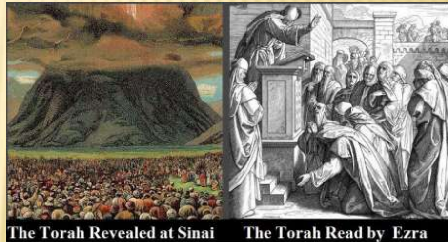
The Torah Revealed at Sinai