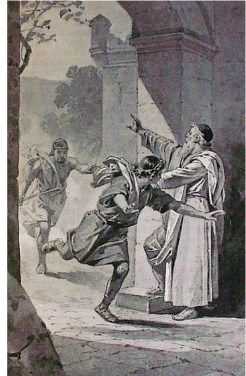
Fleeing to the City of Refuge (Num. 35:11-28). From Charles Foster, The Story of the Bible , 1884.