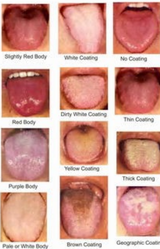
Slightly Red Body White Coating No Coating Red Body Dirty White Coating Thin Coating Purple Body Yellow Coating Thick Coating Pale or White Body Brown Coating Geographic Coating

Stomach Yin is the fluids in your stomach and intestines. Should they become deficient, symptoms such as heartburn, constipation or chronic growing tongue can arise.