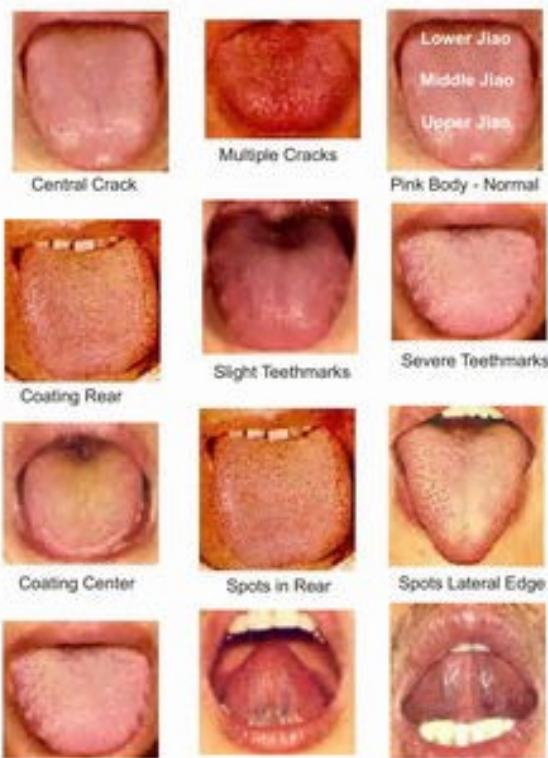
Lower Jiao Middle Jiao Upper Jiao Multiple Cracks Central Crack Pink Body - Normal Coating Rear Slight Teethmarks Severe Teethmarks Coating Center Spots in Rear Spots Lateral Edge Coating Everywhere Spots on the Lateral Edges of the Tongue