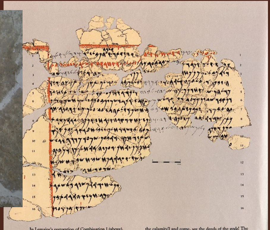
In Lemaire's restoration of Combination I (above),

the column(s) and come see the deeds of the gods! The