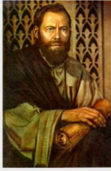
James the son of Alphaeus