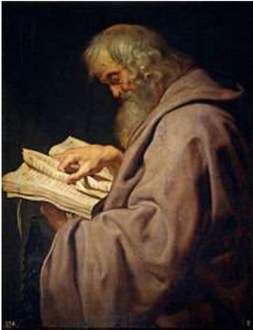
Simon the Zealot (the Canaanite)