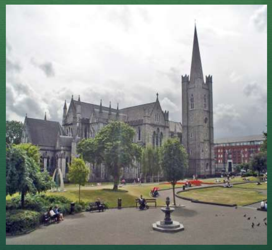
St Patrick's Cathedral

But avoid the city center on Saturdays when half the population seems to go shopping there.