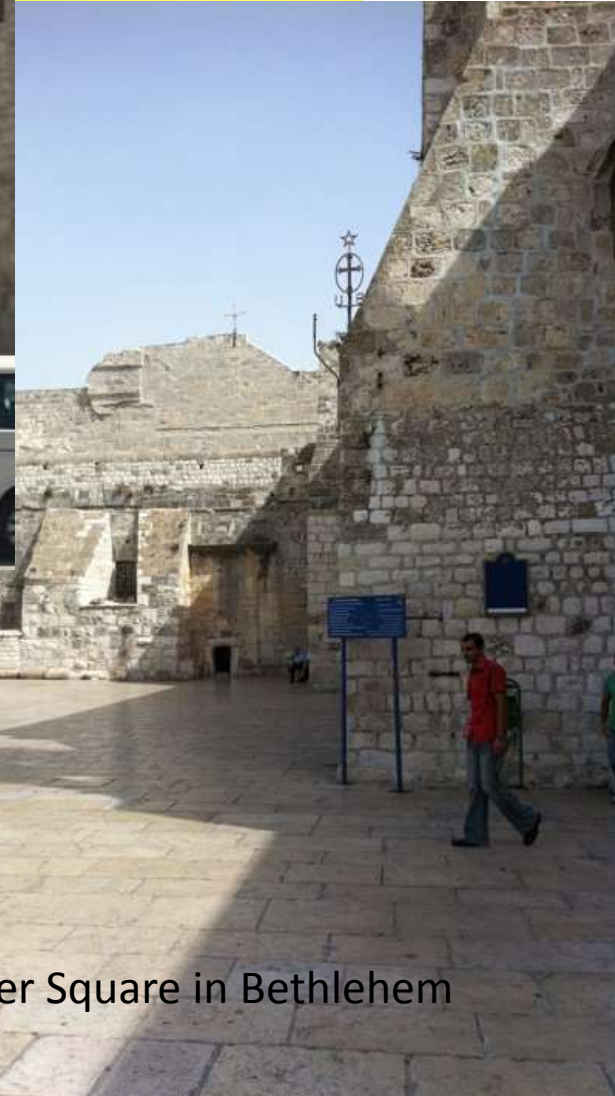
Manger Square in Bethlehem