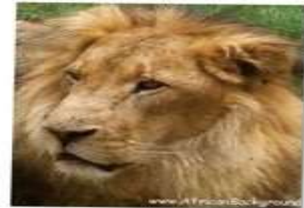
Lion - Kalahari Desert