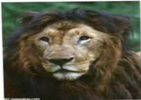
Black-maned Lion - Kenya