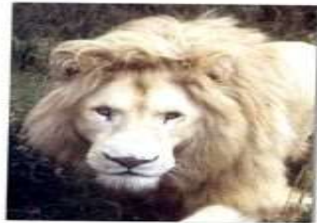
White Lion - Timbavati