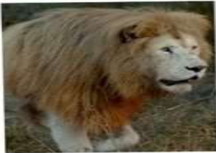
White Lion - Timbavati