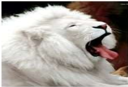
Captive White Lion