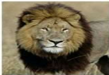
Black-maned Lion - Masai