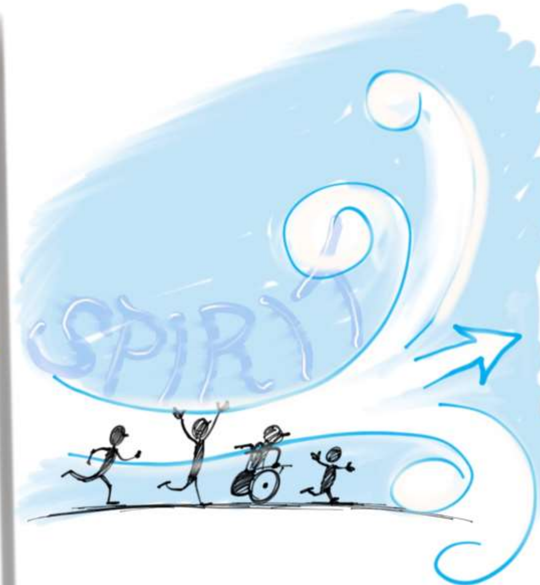
A boundary-breaking God