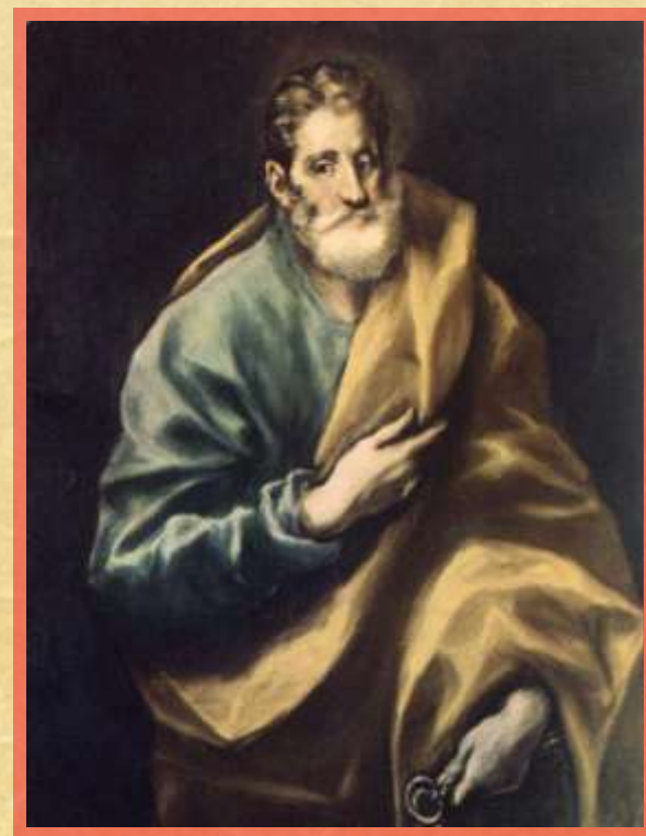
Apostle St. Peter El Greco (1610-1614)