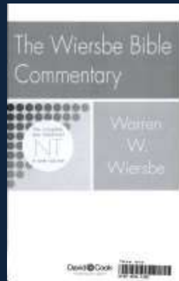
The Wiersbe Bible Commentary: New Testament